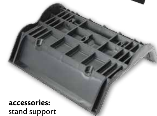
accessories: stand support